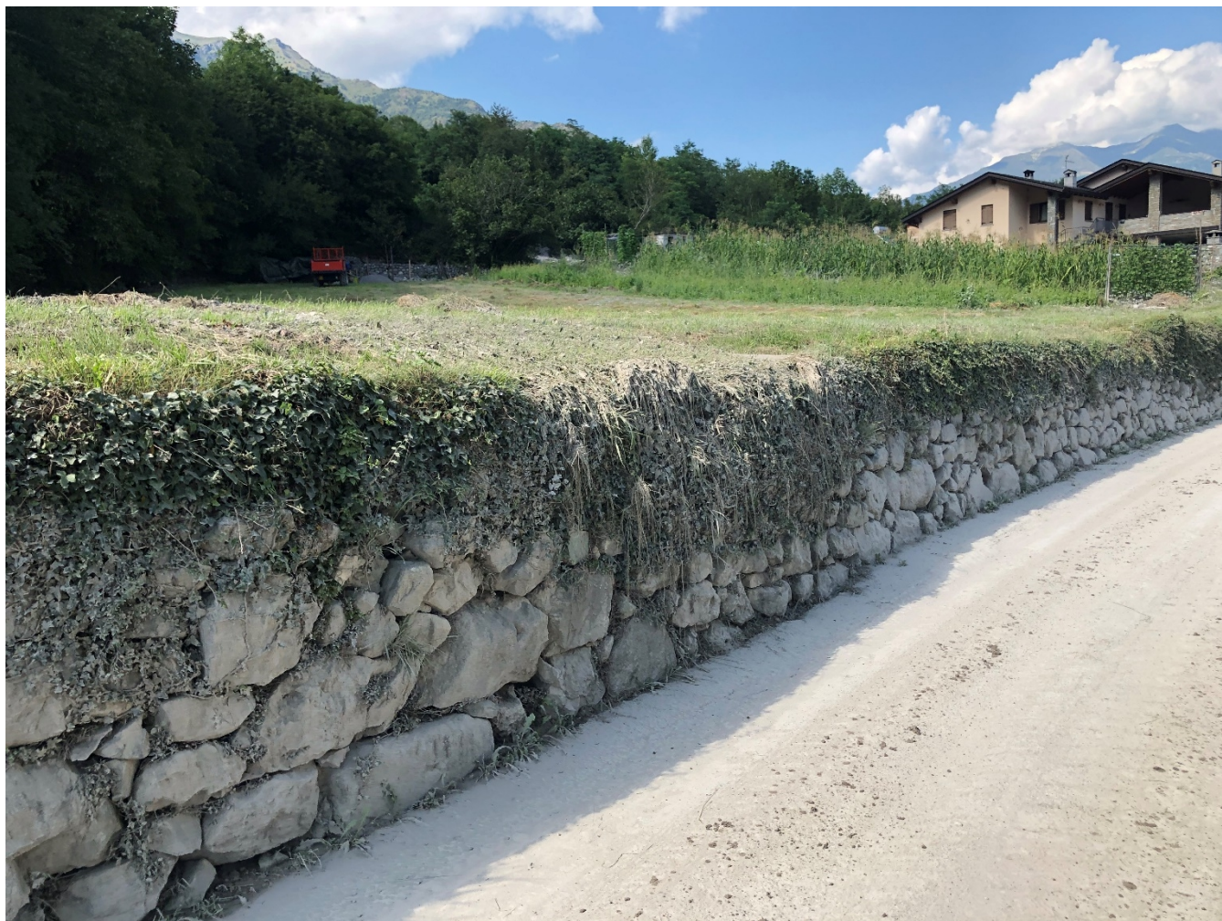
Figure S6. Photo E.