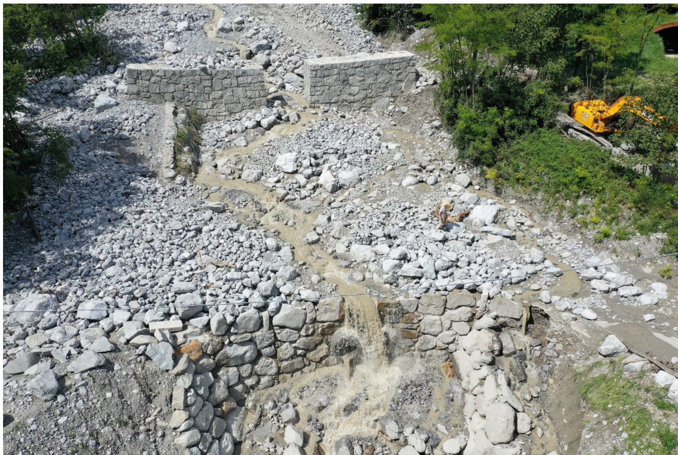
Figure S3. Photo B.