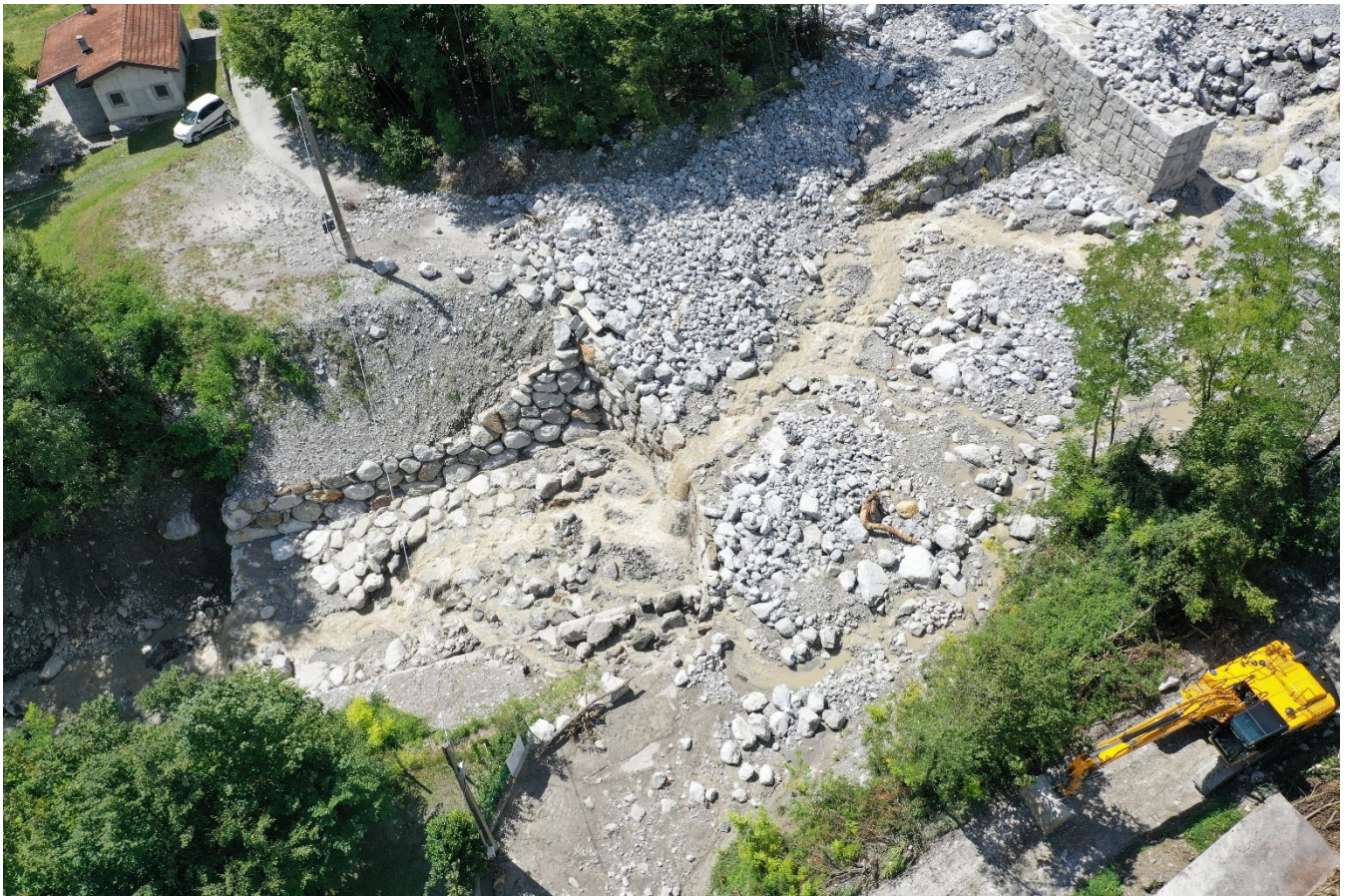
Figure S4. Photo C.