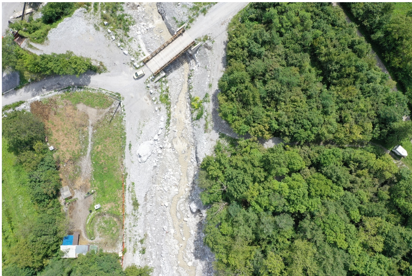
15 Figure S7. Photo F.