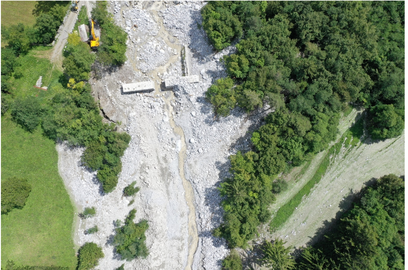
5 Figure S2. Photo A.