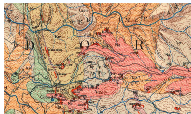
Fig. 1. S Fk AR 1